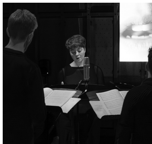
The Marian Consort, Snape Residency, 2023